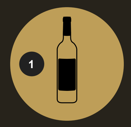
Choose your Sparkling Wine 12x different Options

Refine your celebrations with MRJ Groupe's collaboration with Austria's premier Sparkling Wine producer. Customize 12x different distinct sparkling wines with a unique front label and compliant back label, presenting an elegant touch in accordance with Korean custom law.