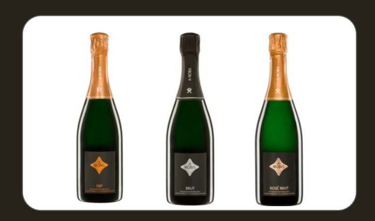
A-Nobis Dry / A-Nobis Brut / A-Nobis Rosé Brut

Explore the nuances of each sparkling gem. For detailed product descriptions, please refer to our product decks.