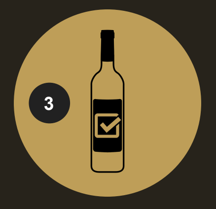
Enjoy your bespoke Sparkling Wine