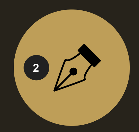
Design your own Label in accordance to Korean custom law