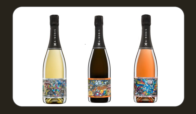
Street Art Brut / Street Art Jardin d'Orangers / Street Art Rosé